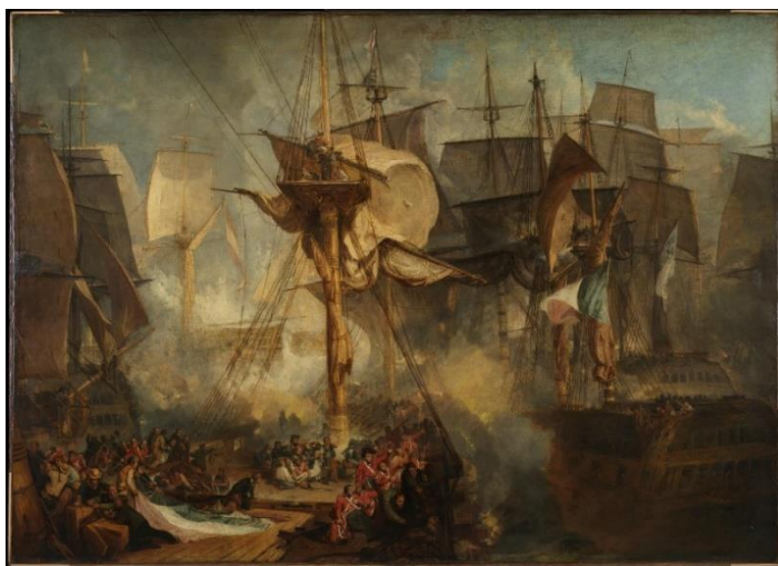
15. The Battle of Trafalgar, as Seen from the Mizen Starboard Shrouds of the Victory , 1806-8, Tate Britain