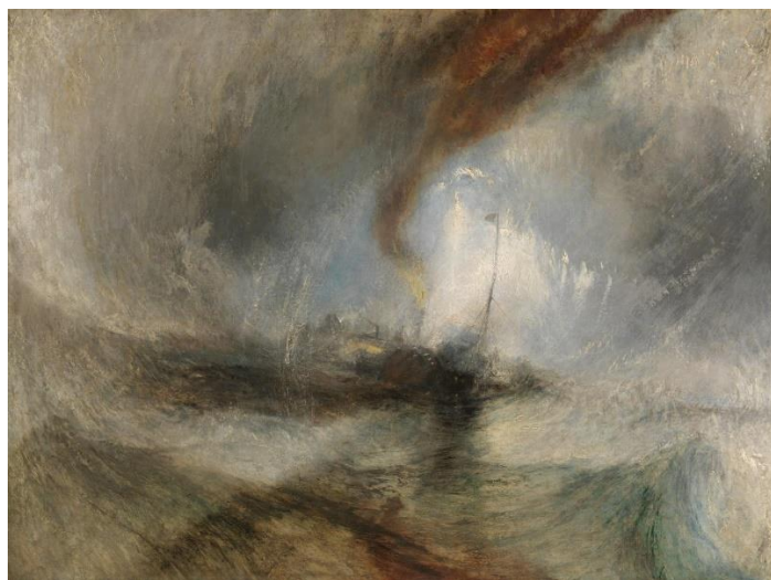
09. Snow Storm - Steam-Boat off a Harbour's Mouth , 1842, Tate Britain