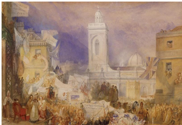
07. The Northampton Election, 6 December 1830 , about 1830-1, Tate Britain