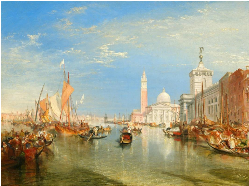
04. Venice: The Dogana and San Giorgio Maggiore , 1834, National Gallery of Art, Washington