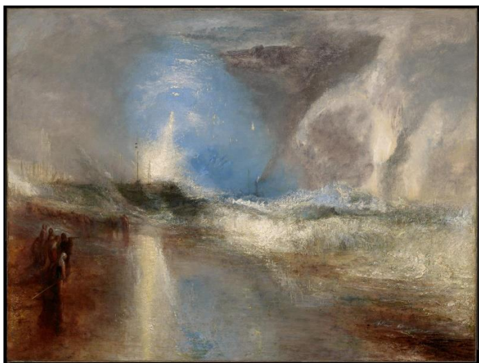
08. Rockets and Blue Lights (Close at Hand) to Warn Steamboats of Shoal Water , 1840, Sterling and Francine Clark Art Institute