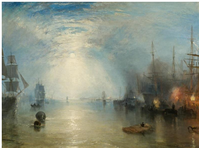
11. Keelmen Heaving in Coals by Moonlight , 1835, National Gallery of Art, Washington