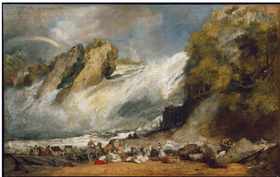
10. Fall of the Rhine at Schaffhausen , about 1805-06, Museum of Fine Arts, Boston