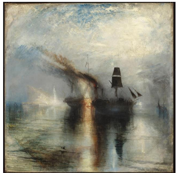
03. Peace – Burial at Sea , 1842, Tate Britain