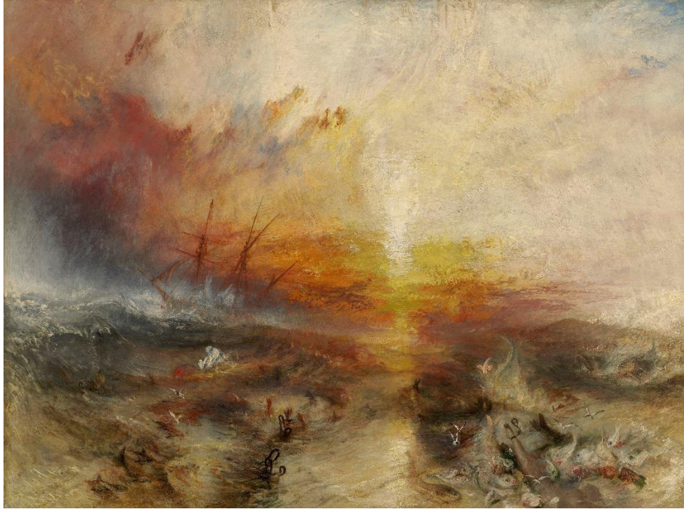
01. Slave Ship (Slavers Throwing Overboard the Dead and Dying, Typhoon Coming On) , 1840, Museum of Fine Arts, Boston

All works by Joseph Mallord William Turner (English, 1775–1851)