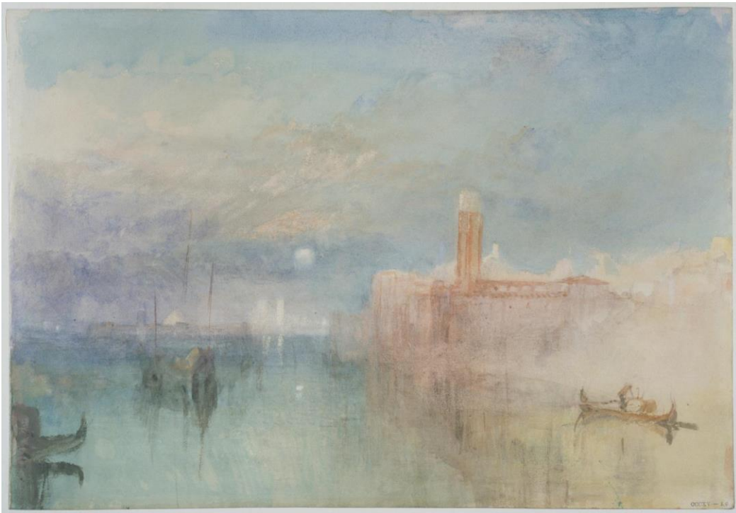
05. Venice by Moonlight, with Boats off a Campanile , 1840, Tate Britain