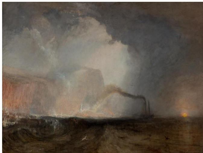
12. Staffa, Fingal's Cave , about 1831-32, Yale Center for British Art