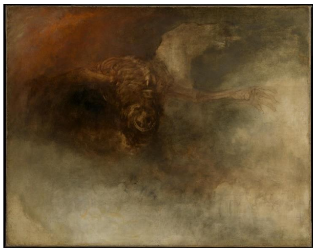
14. The Fall of Anarchy (?) , about 1833-4, Tate Britain