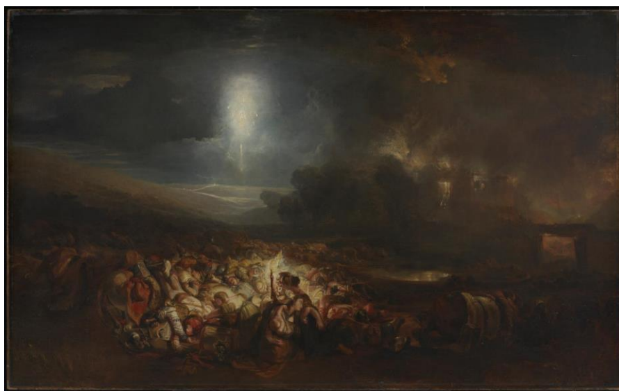
13. The Field of Waterloo , 1818, Tate Britain