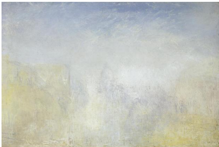
06. Venice with the Salute , about 1840-45, Tate Britain