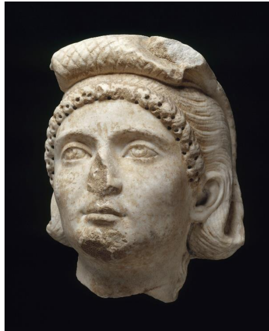
15. Portrait of an empress, possibly Fausta, 300–325 "Byzantine Art" Gallery