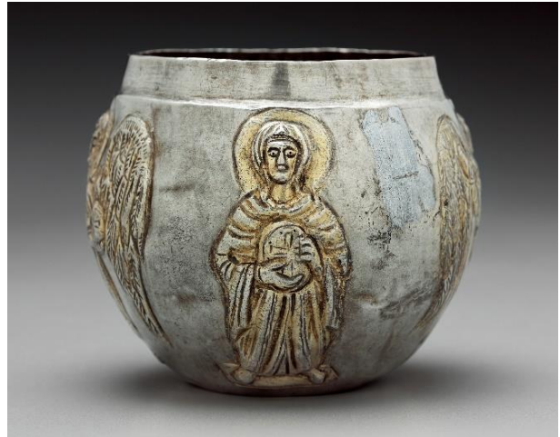
19. Spherical small container (pyxis) with representations of Christ, Virgin and two archangels, 6th–7th century C.E. "Byzantine Art" Gallery

The enclosed images are provided to you solely for your one time use to illustrate original news stories or educational articles written and published about Art of Ancient Greece, Rome and the Byzantine Empire, opening on December 18, 2021. Please return or destroy these materials after this time.