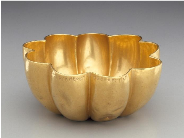
18. Libation bowl (phiale mesomphalos), about 625 B.C.E. "Early Greek Art" Gallery