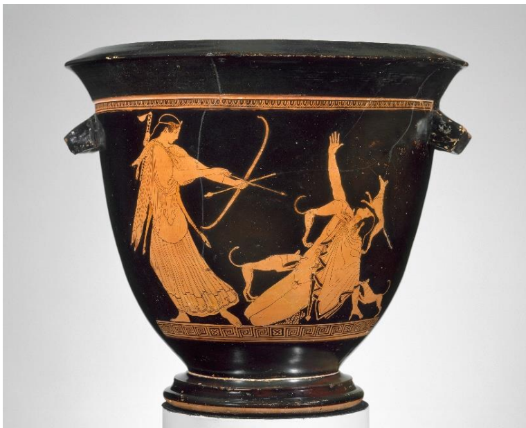
10. Mixing bowl (bell krater) with the death of Aktaion and a pursuit scene, about 470 B.C.E., the Pan Painter "Gods and Goddesses" Gallery