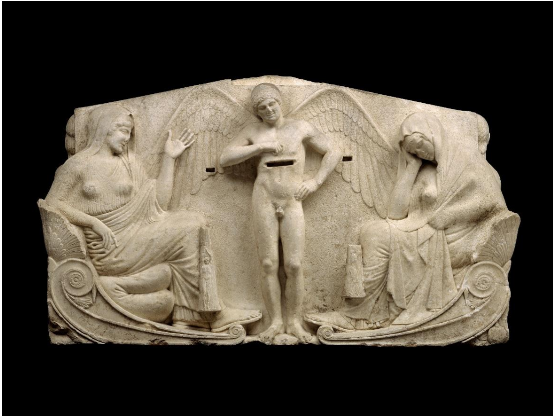
9. Three-sided relief with a scene of weighing ("the Boston Throne"), about 460 B.C.E. "Gods and Goddesses" Gallery