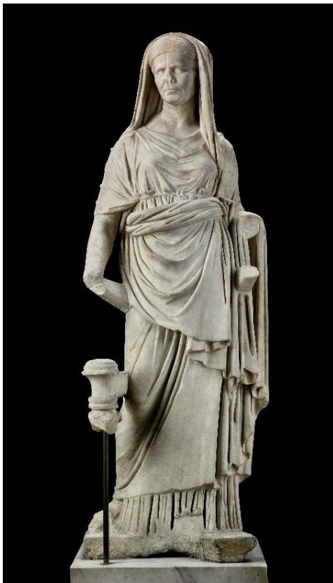
7. Priestess burning incense, about 125–130 C.E. "Roman Portraiture" Gallery