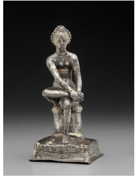
6. Seated dancer, late 4th century C.E. "Byzantine Art" Gallery