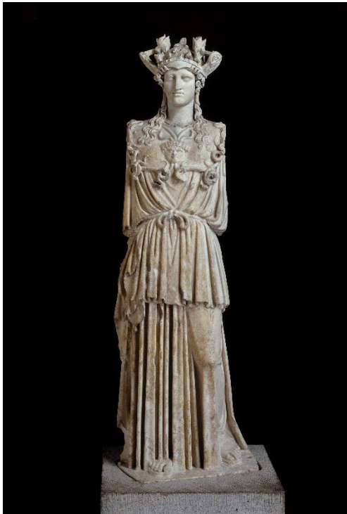
1. Statue of Athena Parthenos (the Virgin Goddess), 2nd or 3rd century C.E. "Gods and Goddesses" Gallery