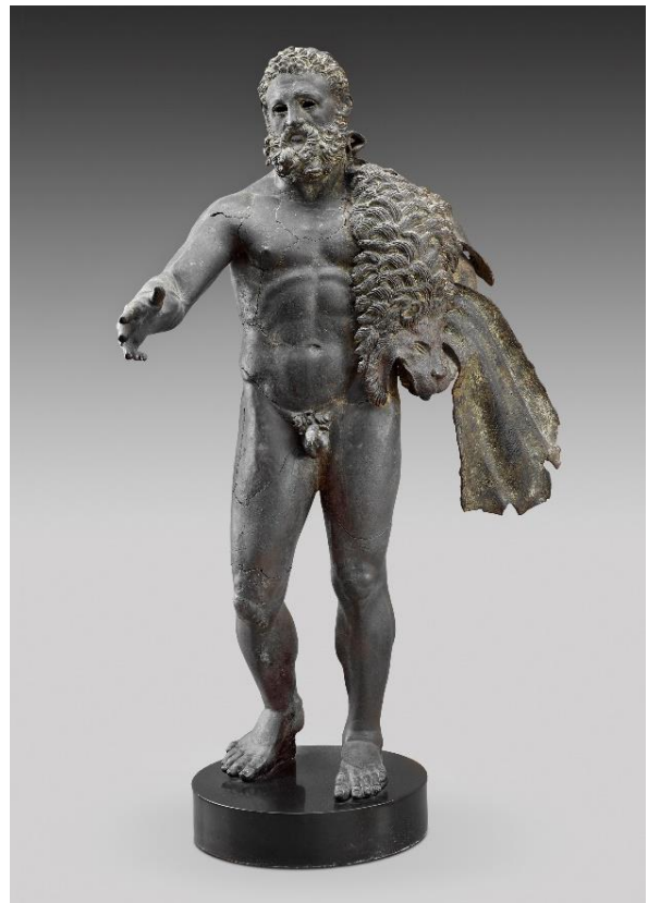
8. Statue of Herakles, about 1st century B.C.E. – 1st century C.E. "Gods and Goddesses" Gallery