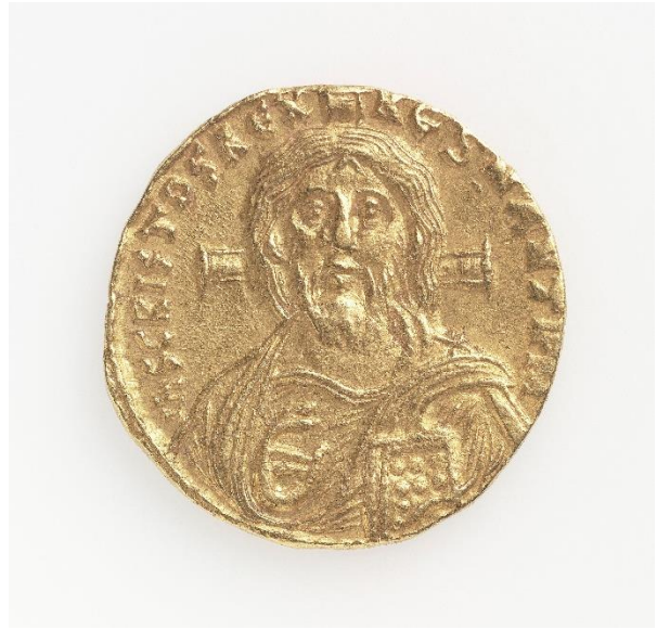
17. Solidus of Justinian II with bust of Christ, 692–695 C.E. "Byzantine Art" Gallery