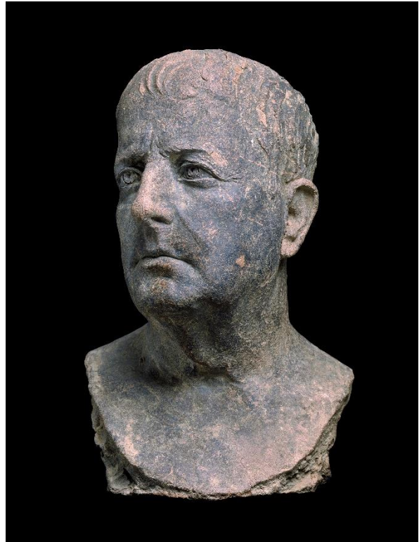
13. Bust of a man, 1st century B.C.E. "Roman Portraiture" Gallery