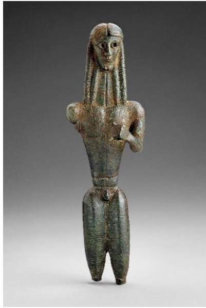
5. Mantiklos "Apollo," about 700–675 B.C.E. "Early Greek Art" Gallery