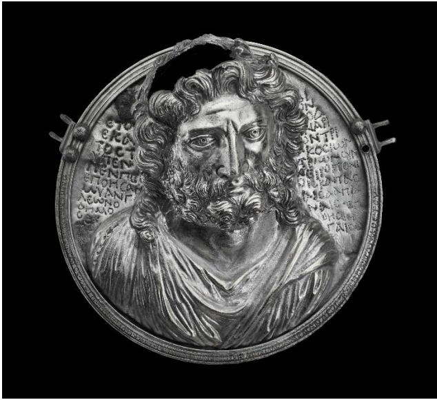
16. Medallion with bust of Zeus and chain, late 2nd century C.E. "Gods and Goddesses" Gallery