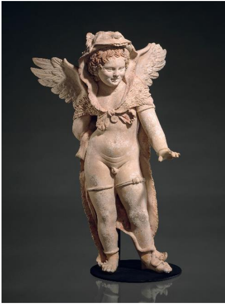
4. Statuette of Eros wearing the lionskin of Herakles, late 1st century B.C.E. – early 1st century C.E., the Diphilos' workshop, "Gods and Goddesses" Gallery