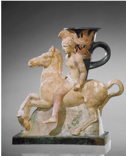
14. Rhyton in the form of an Amazon riding a horse, about 440 B.C.E., Sotades "Early Greek Art" Gallery