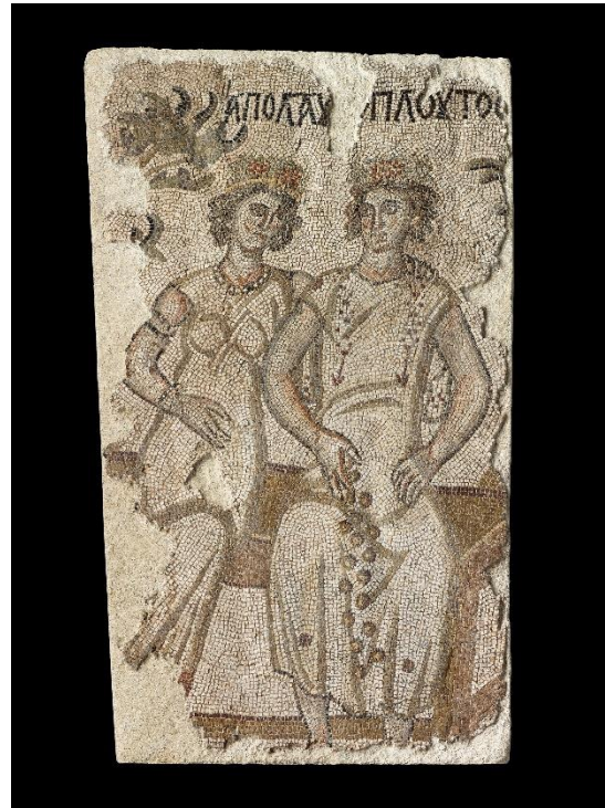
2. Mosaic with personifications of Pleasure and Wealth, 6th century C.E. "Byzantine Art" Gallery