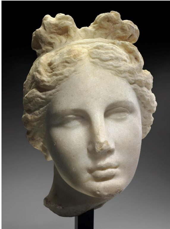
12. Head of Aphrodite ("The Bartlett Head"), about 330–300 B.C.E. "Gods and Goddesses" Gallery