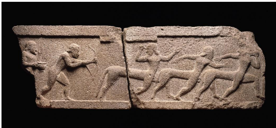
3. Architrave relief from the Temple of Athena at Assos with a scene of Herakles and Centaurs, about 540–525 B.C.E. "Early Greek Art" Gallery