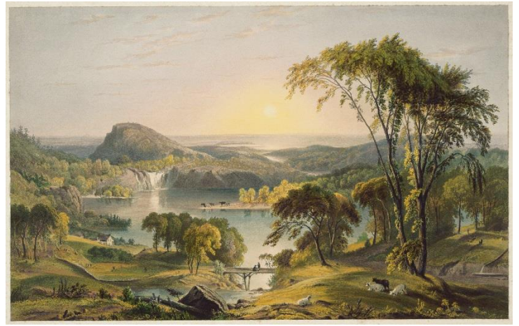
05. Lake Ontario, New York, Summer, Lake Ontario Jasper Francis Cropsey