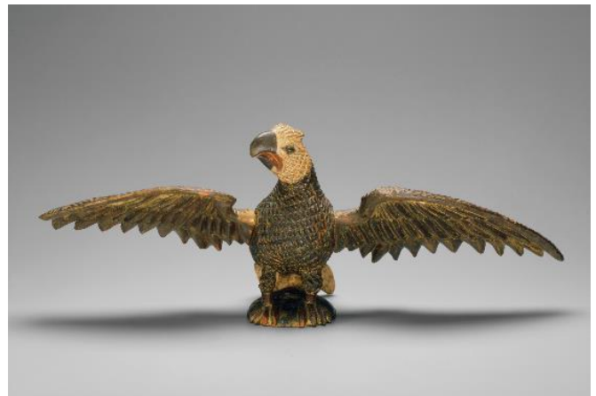
07. Eagle with widespread wings , 1860–90, Wilhelm Schimmel