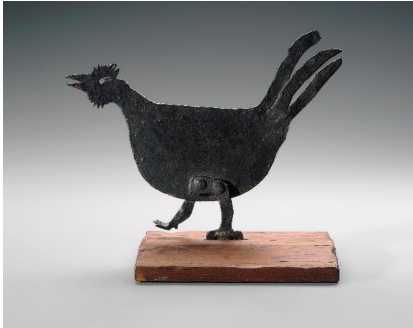
01. Foot Scraper , about 1890–1900, unidentified artist