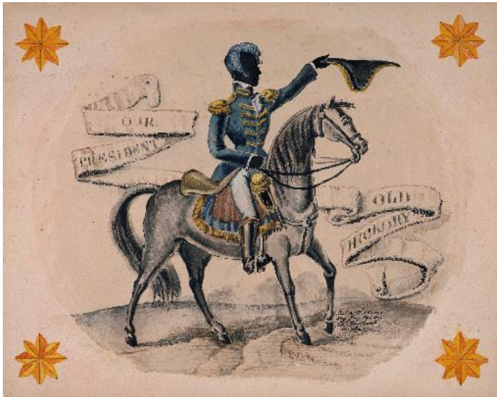
02. Our President, Old Hickory (Andrew Jackson), 1830