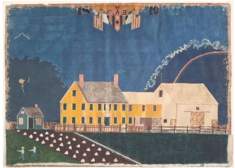
03. Farmstead in Passing Storm , 1849, unidentified artist