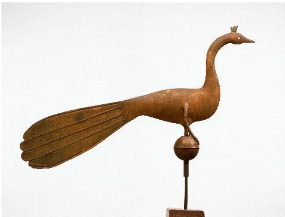
06. Peacock weather vane , about 1860–75, unidentified artist